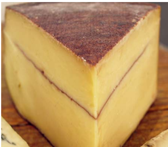
PICTURE: Ubrriaco Amarone

Ubrriaco Amarone - Semi hard wine soaked cow's milk cheese from Trentino Transforming cheese with wine; Replacing salty with alcoholic sweetness. Unique & Robust.